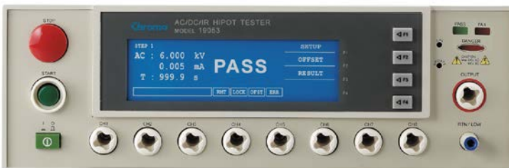
Fig. 1 Chroma AC/DC/IR HIPOT Tester 19053

Long title to answer a simple question: “Is it plugged in?”. Annoying, yet true. As necessary as it is to plug in the tester, it is more serious to tightly connect the device under test (DUT). Chroma 19053, 19054 Series Hipot Testers come equipped with a current limit feature that when enabled will not output the voltage to the DUT when the leakage current does not exceed the set low limit. Nice safety feature, especially if there were no device connected and an operator made contact with the output terminals.